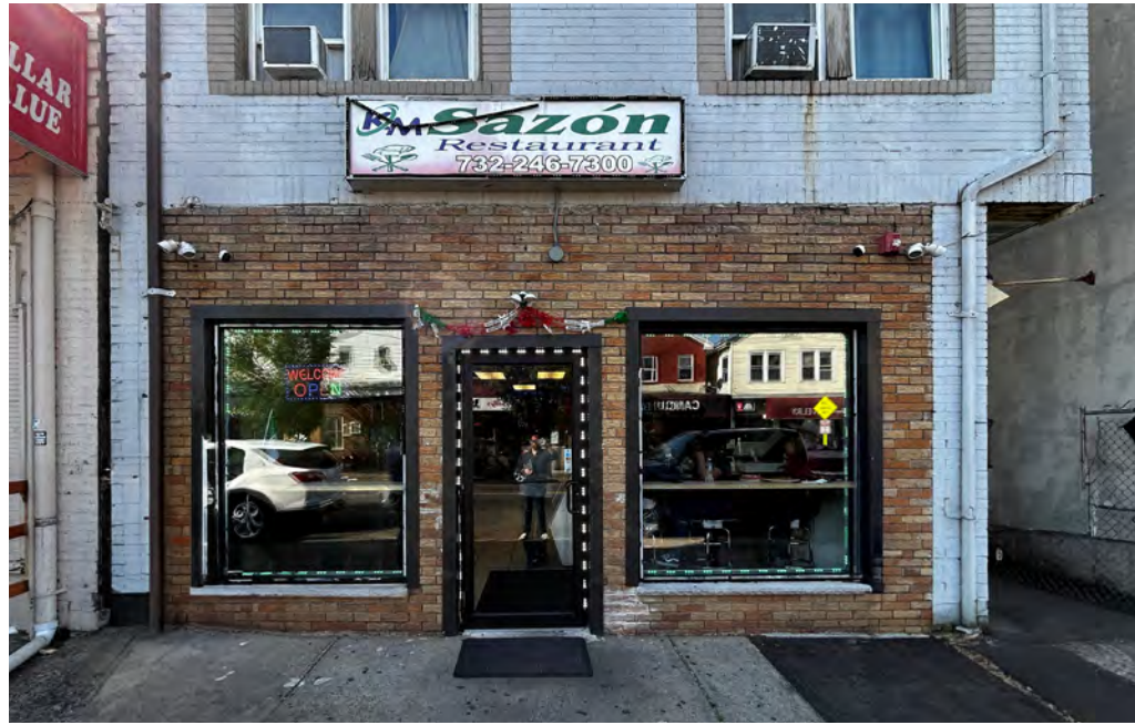
KM Sazon Restaurant in New Brunswick before intervention.

A comprehensive digital dashboard to take advantage of data is in development. This tool is a game-changer for Montclair Center, enhancing the way public spaces are activated, managed, and experienced.