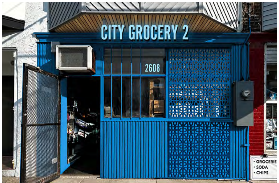
Above top: City Grocery in Atlantic City before intervention. Above bottom: City Grocery, proposed intervention rendering.