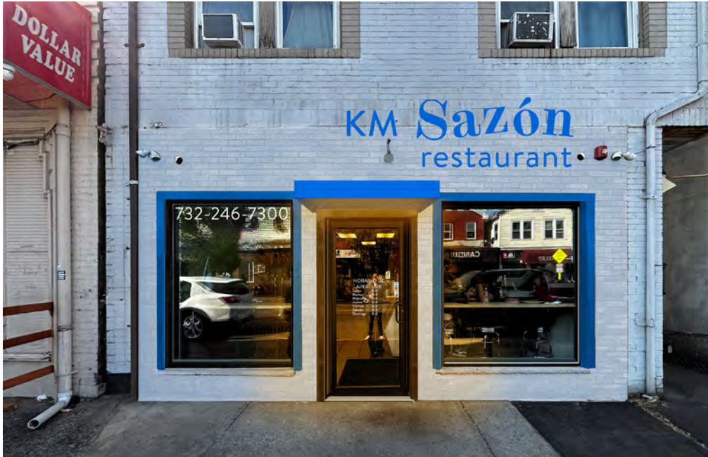
KM Sazon Restaurant, proposed intervention rendering.

nesses, often the backbone of sales and foot traffic in our towns, have a magnetic effect.