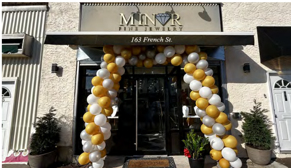
New Brunswick, Joyeria Minor opening day.